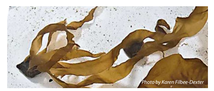
The Green Gravel method of growing kelp on small stones for transplanting into restoration plots.

This research will focus on the two locally dominant canopyforming kelp species, Macrocystis pyrifera (giant kelp) and Nereocystis luetkeana (bull kelp). Using genomic techniques, he will characterize the genetic diversity of various populations and make connections with traits. Once these are better understood, he will be able to apply this knowledge to test different strategies for out-planting. He will assess if it is better to plant a low diversity of stress-tolerant genotypes of kelp or a random but diverse set of genotypes. If one strategy yields greater success, it can be implemented more broadly.